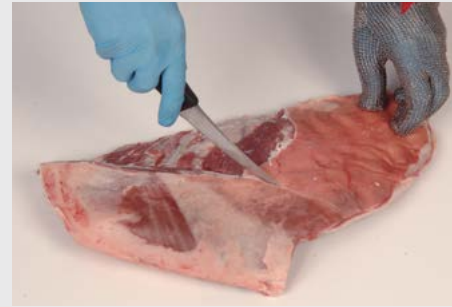
3. Remove excess fat