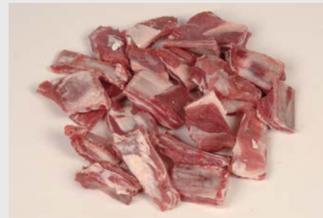
7. Cut individual ribs into 30-40 mm length pieces,