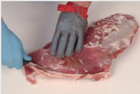
5. as illustrated.